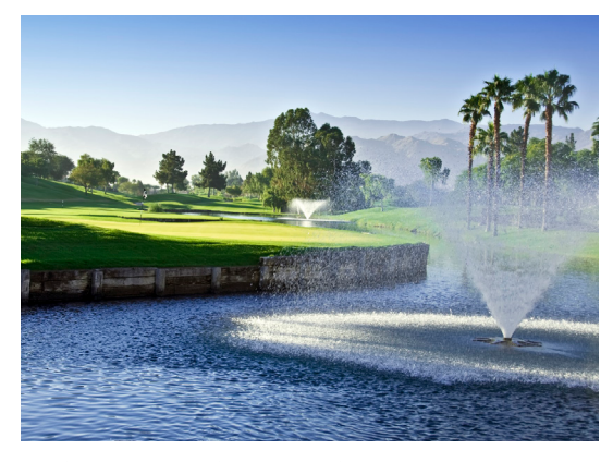
PRECISE POND, SPECTRUM, DEVOUR, TRUE BLUE and JET BLACK are trademarks of Precision Laboratories, Inc.