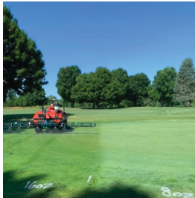
Cascade™ Tre applied at 4-times the label rate with 24-hour delayed irrigation.

Cascade™ Tre , the next innovation in the Cascade™ brand, was built to provide the same trusted Cascade™ performance, with the flexibility to delay watering after application without concern of turf injury.