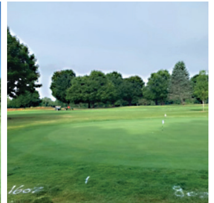
Cascade™ Tre treated creeping bentgrass 24-hr later with no phytotoxicity.

In PROVE™ demos across the country, Cascade™ Tre was applied at 4-times the label rate with delayed watering to demonstrate consistent turf safety.