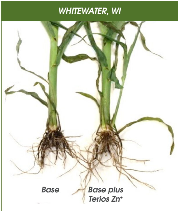
Two year Terios Zn+ Summary Yield Results, Corn - 2017, 2018 WI, IL, IA