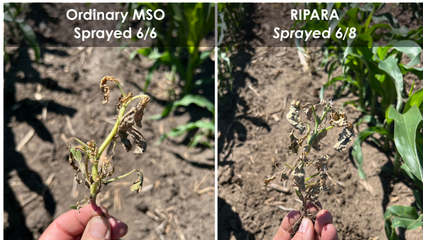
Plants in above images were treated with Impact® (1.0 oz/A), Atrazine (0.5 lbs/A), and AMS (2.5 lbs/A) with and without RIPARA.

When compared to an ordinary MSO, RIPARA provided superior efficacy and better coverage for a more complete and faster weed kill.