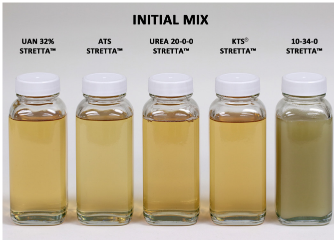
STRETTA adds a darker, amber color, but mixes easily.