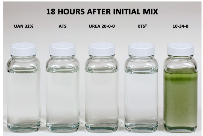
10-34-0 naturally separates even without combining with other products.