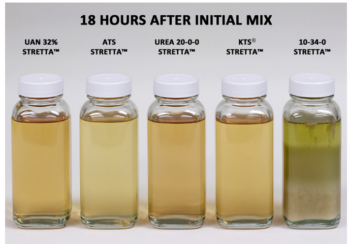
STRETTA stays in solution with common fertilizer products. 10-34-0 requires agitation with or without STRETTA.

Stretta is a trademark of Precision Laboratories, LLC KTS is a registered trademark of Tessenderlo Kerley, Inc.