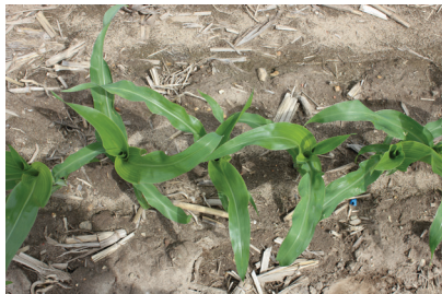
Terios Zn +