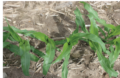
Terios Zn + and HydraLink

The corn yield and vigor results are the summary of eleven small plot 3rd party research trial locations in IL, NE, and WI.